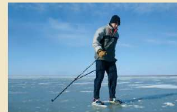
In the country covered with snow for one third of the year, trust the locals to show you winter activities that you have never thought about - they'll be fun for sure!