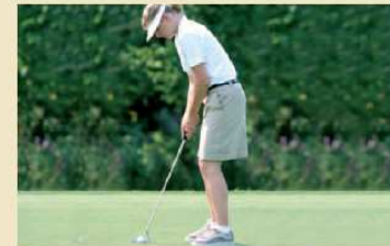
Enjoy the brand new golf fields of Estonia! Choose among the ones that are situated near Tallinn and the airport, or those in further south.