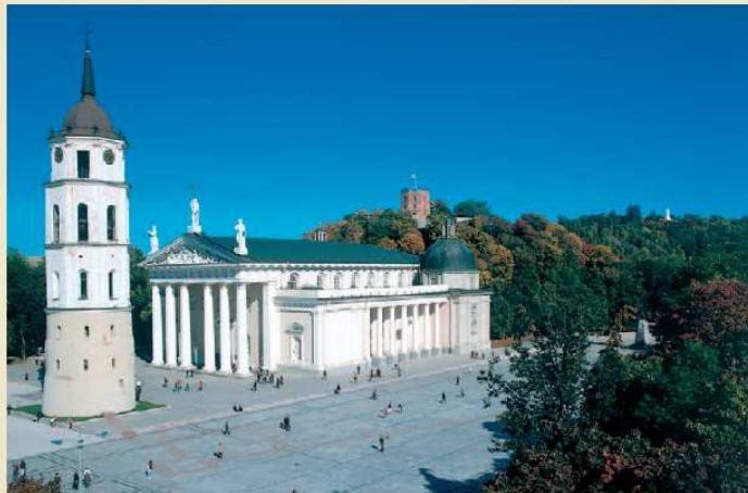
Vilnius has its own very special atmosphere - friendly people, cozy restaurants and green parks. It is something that you must experience to be able to tell.