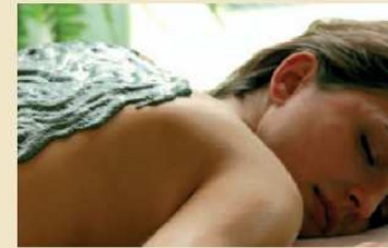
Estonian sea- and lakeside spas offer exclusive treatments - mud therapy is an example.

Estonia is a great destination during winter. Have a snow-fight, go ice-skating and try ice-surfing on the sea, go ice-climbing, play ice-golf, build a snow castle, take a horse drawn sleigh ride or try the best barbecue you ever had in the snowy forest. After that, enjoy a cup of hot wine or a shot of ice cold famous Estonian vodka.