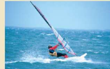
Water activities are extremely popular at the sea coast. They don't have to be extreme - but can be, if you wish so.